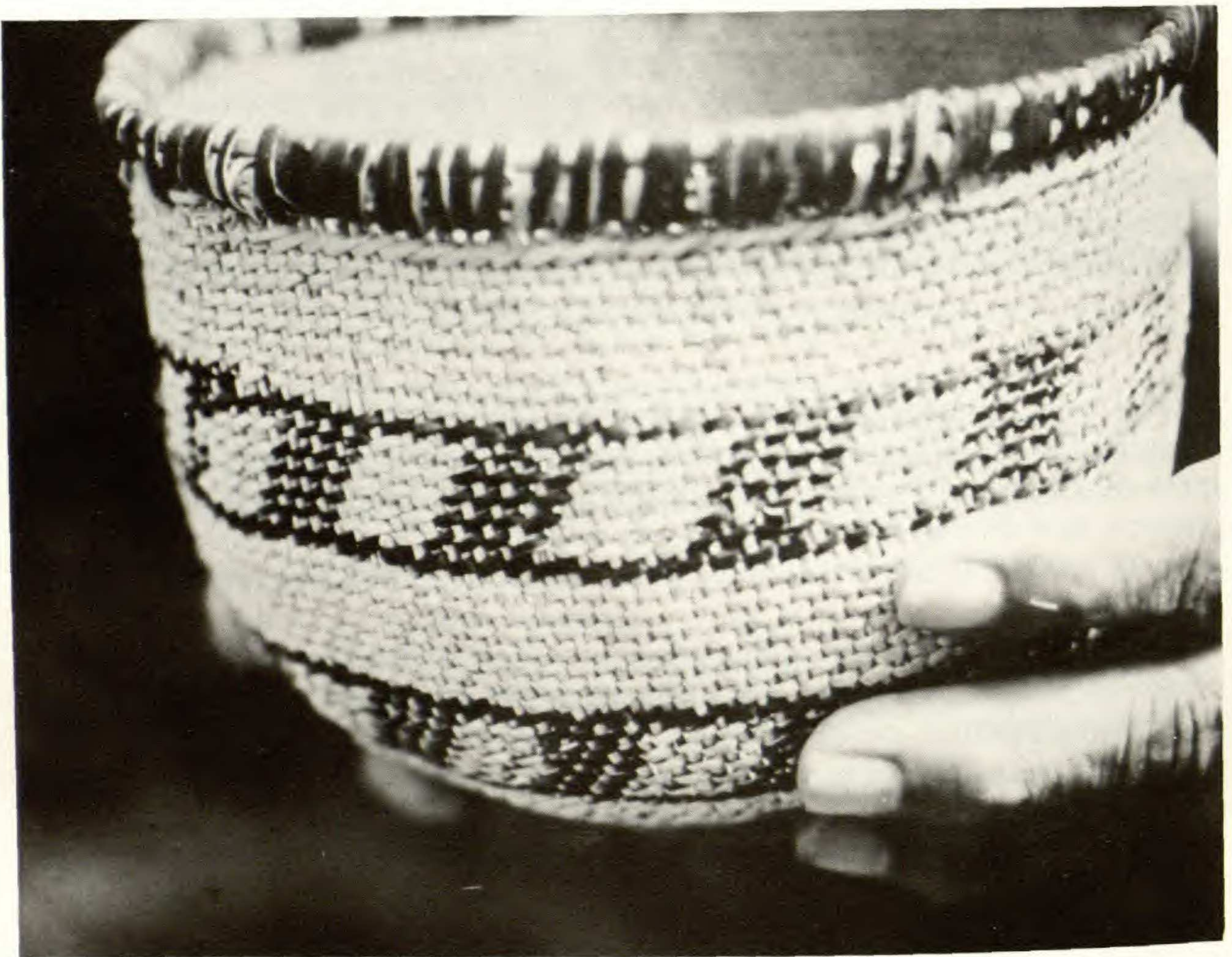
FIG. 1.—A Miwok coiled basket. The dark designs are made with split redbud bark.

most of the redbuds are mature and of tree size. The greatest number of immature redbuds are found along roadcuts. Furthermore, there are dying redbud shrubs under oak canopies. The shrub is not very shade tolerant and is outcompeted in such situations, by other species (Stewart Winchester, pers. comm. 1988). 5 Perhaps the current status of redbud reflects the absence of intense fires due to fire exclusion practices by public lands agencies, and the lack of Indian management of redbud at these sites.